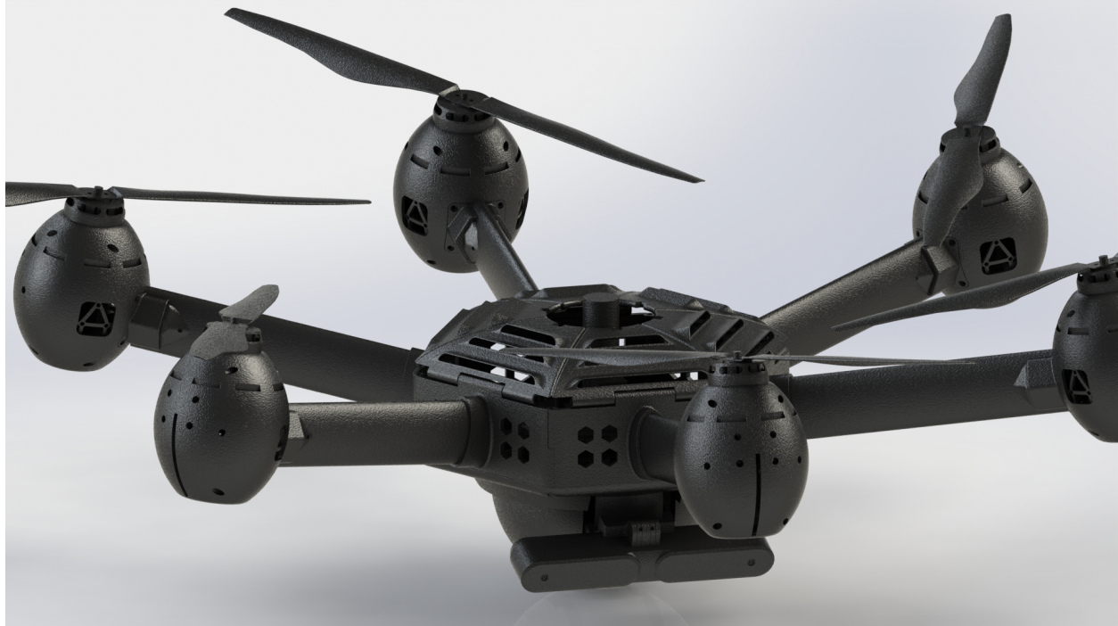
Figure 1: Improved airframe design.