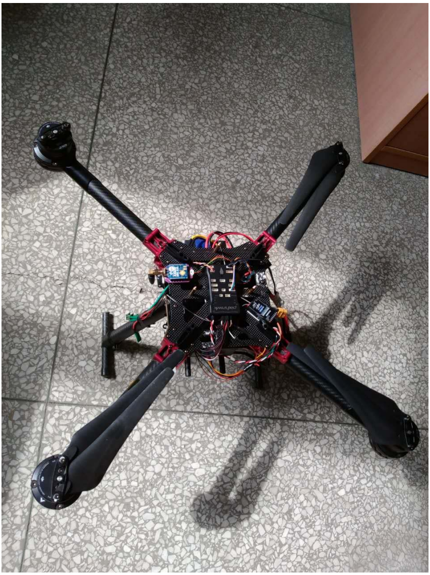
Figure 2. Flight platform of THBOT